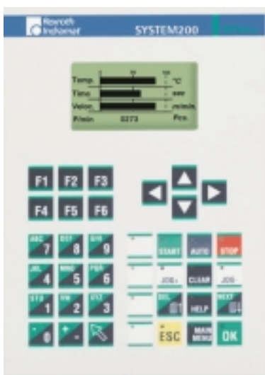
Illustration example: BTV04.2

"Schutzvermerk DIN 34 beachten" - "Copyright reserved"